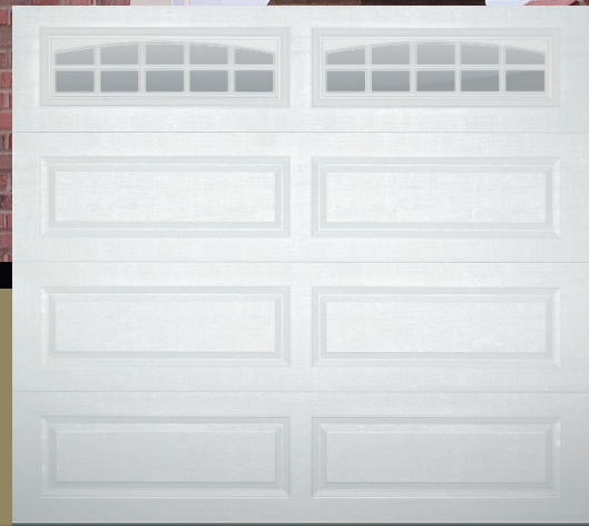
8' x 7' 4216 white with optional cascade window inserts