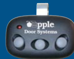
3-Channel Transmitter (Standard)