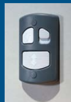
Deluxe Wall Station